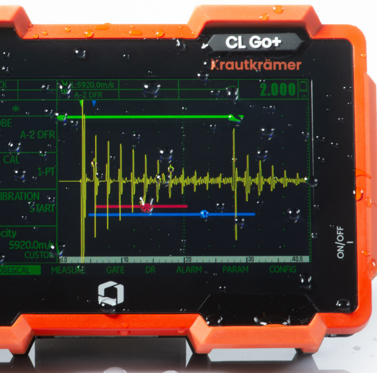
Krautkrämer CL Go+ offers a full range of functionality in an easy to use, compact and rugged package.